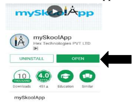
Step 3: Download and install the app